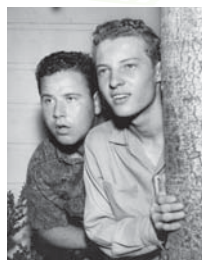
Frank with Ken Osmond

In remembrance of Frank Bank who played Lumpy Rutherford on Leave It To Beaver which shot its first two seasons at Studio Center starting in 1957. Beaver's house was located on the spot of the current Bungalow 10.