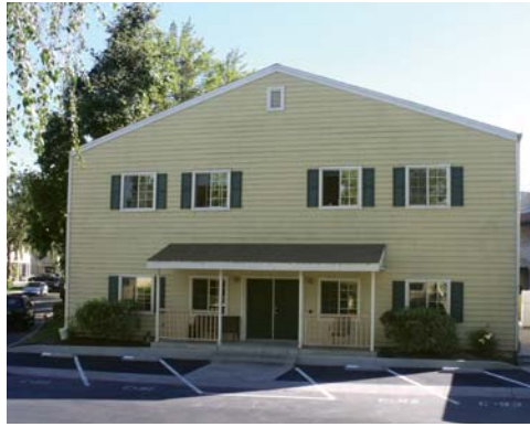
The main entrance to The Republic Building on Gunsmoke Avenue.

In 1935 Mascot Pictures, Consolidated Film Industries and Monogram Pictures joined forces with a bunch of independent producers and they took over the studio, forming Republic Pictures. The studio quickly became a major force in the industry, with membership in the Motion Picture Association of America. Republic was known for its first class production facilities, efficient use of stock footage, superior editing equipment and possibly