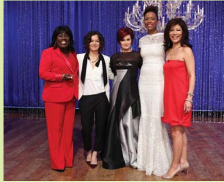
The ladies of THE TALK salute the 40th Annual Daytime Entertainment Emmy Awards. Pictured L-R: Sheryl Underwood, Sara Gilbert, Sharon Osbourne, Aisha Tyler, and Julie Chen.